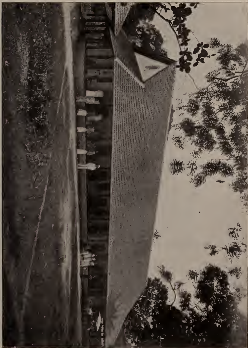
MAIN WARD OF GENERAL MEDICAL MISSION, MANEPPY, JAPAN.

It is an unspeakable privilege which the medical missionary enjoys of relieving a portion, at least, of the suffering which he sees about him. When